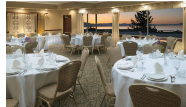
Lakeview Room, Event! Center