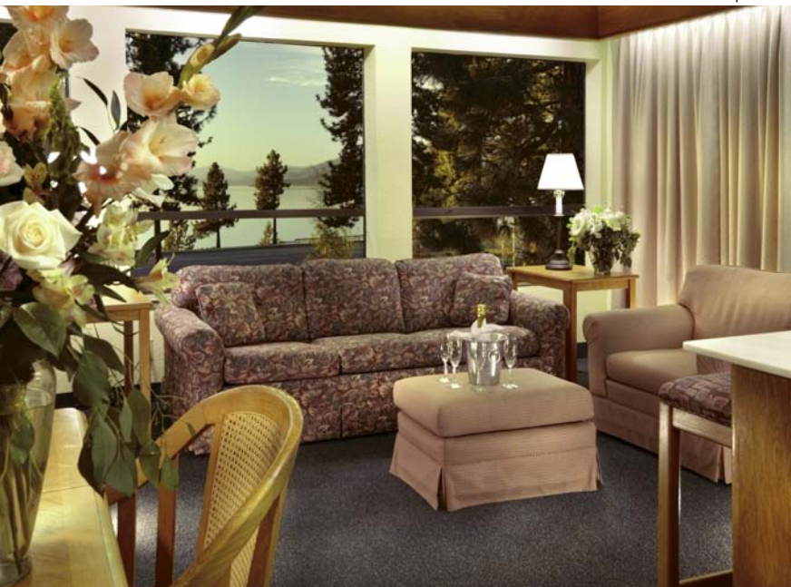
Deluxe Spa Suite