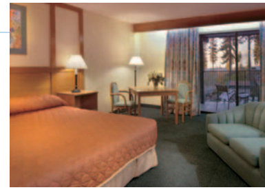
King Great Room